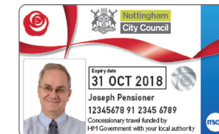
Examples of English National Concessionary Travel Scheme cards